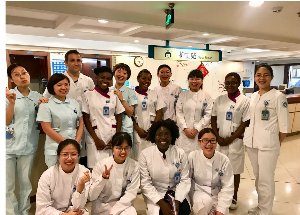
International undergraduates, Chinese undergraduates and clinical mentors