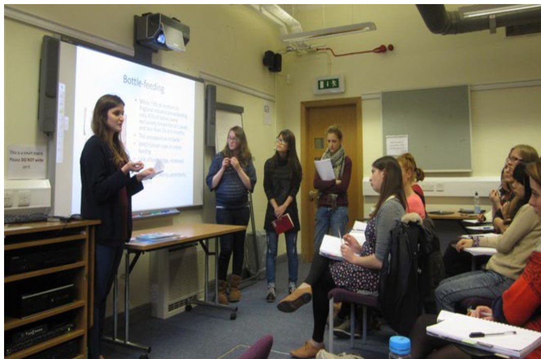
Exchange undergraduates at the University of Edinburgh