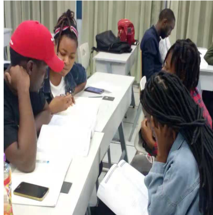
International undergraduates group discussion in classroom