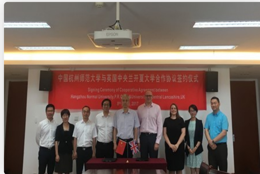
Cooperative agreement ceremony with the University of Central Lancashire