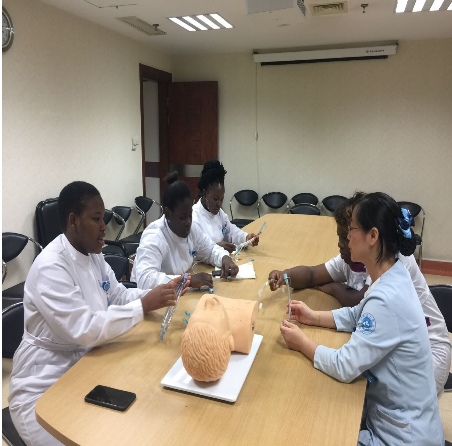
Simulation training for international undergraduates