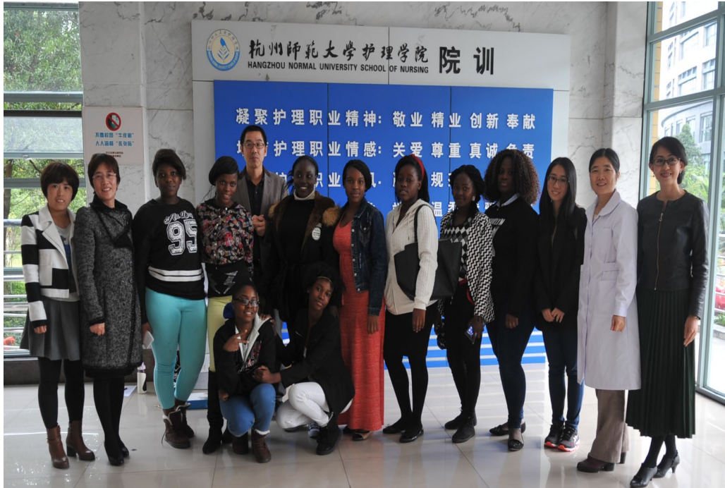
International undergraduates with nursing faculty